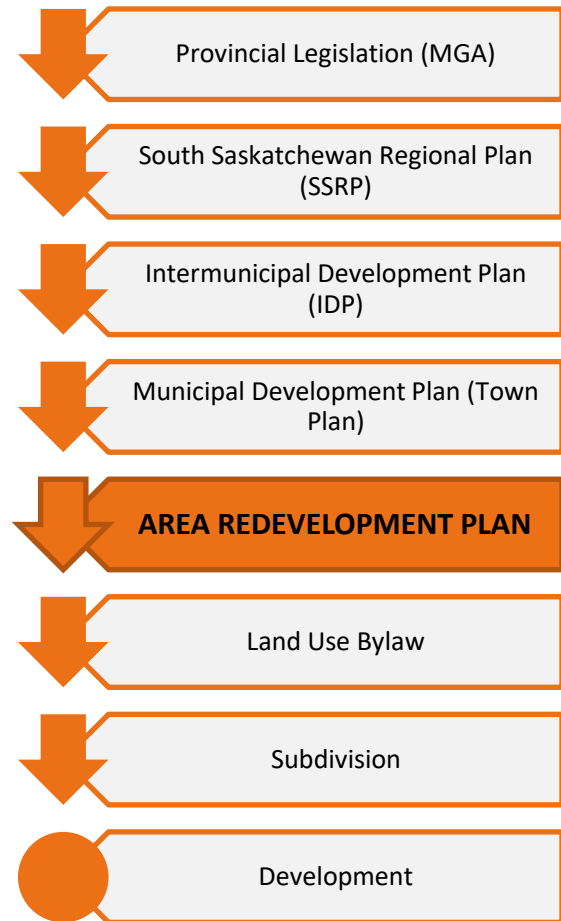
Figure 1 – Planning Hierarchy

Coaldale should regularly monitor this ARP and consider and adopt amendments as required to reflect changes in the Plan Area and the municipality's goals and objectives. This ARP should be considered a living document which should be reviewed on an ongoing basis to ensure it is current and relevant to the Plan Area.