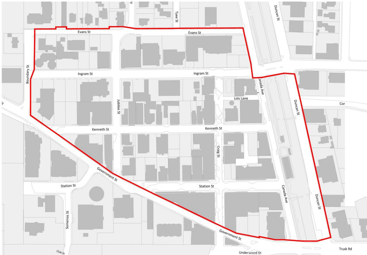
Exhibit "B" Streets and Parking Regulations Bylaw No. 3101 Downtown Core